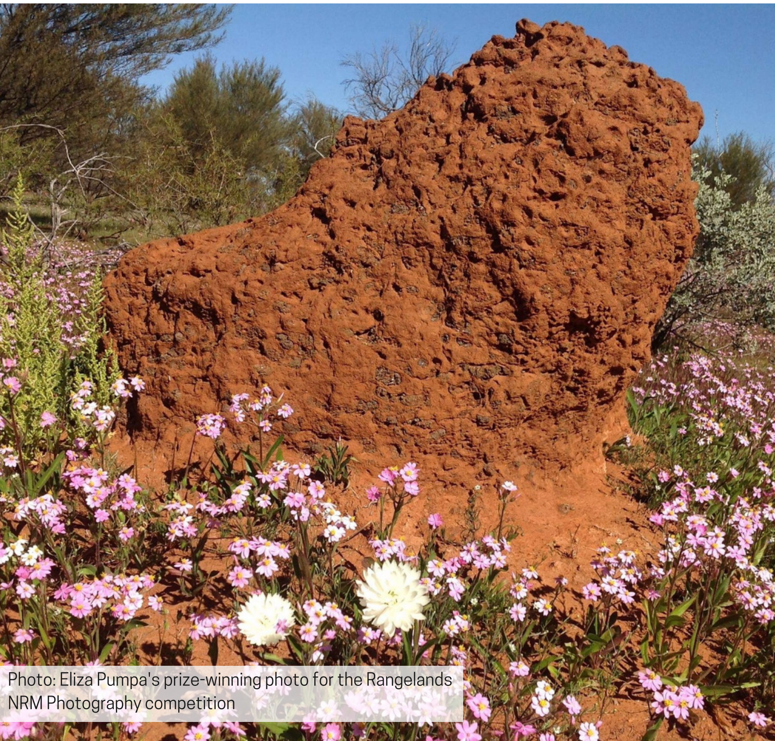
Photo: Eliza Pumpa's prize-winning photo for the Rangelands NRM Photography competition

LIFE IN THE SHIRE OF MURCHISON, WESTERN AUSTRALIA