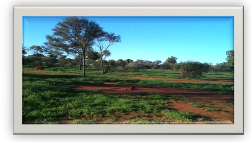
If anyone has any good photos please send them in!

So after a lot of rain just before Christmas, Murchison is looking greener then ever!